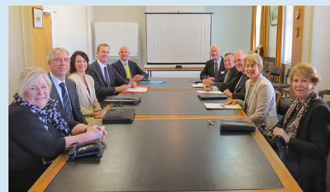
The RFDS Tasmania Board meeting with The Hon Michael Ferguson and The Hon Peter Gutwein.

The RFDS Tasmania Board met with State Treasurer, The Hon Peter Gutwein and Minister for Health, The Hon Michael Ferguson. The Board members discussed the role that the RFDS plays in Tasmania and the opportunities for expanded primary health care programs in rural and remote areas where services are not easily accessible.