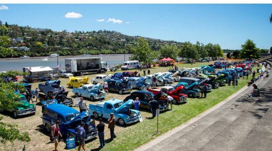
Australian Early Holden Federation National Titles.