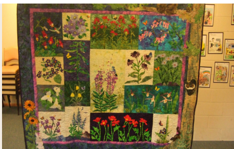
The quilt made by the Bridport Textile Group.