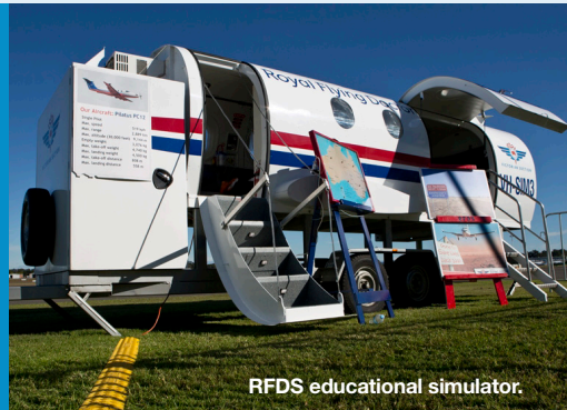
RFDS educational simulator.