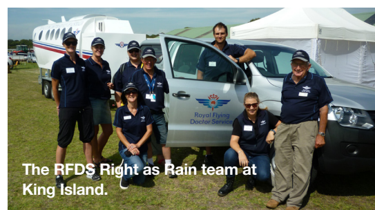
The RFDS Right as Rain team at King Island.

For the King Island Show the RFDS was supported by a nurse from Family Planning Tasmania to address family planning with community members.