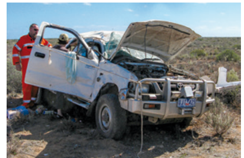
> Pat and Judith's wrecked four-wheel-drive.

"It is very rewarding to see that the service