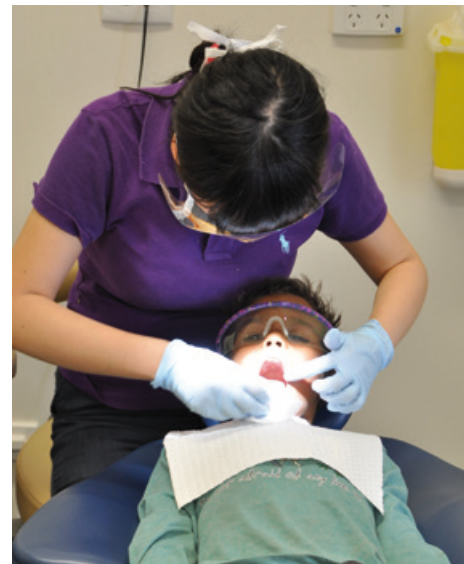
> The RFDS Remote Oral Health Care Program in action.