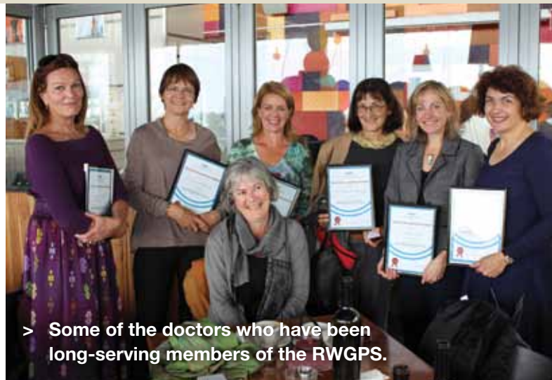
> Some of the doctors who have been long-serving members of the RWGPS.

"Our service provides a much appreciated choice of gender because, in the words of some of our patients - sometimes only a female doctor will do," she said. The Rural Women's