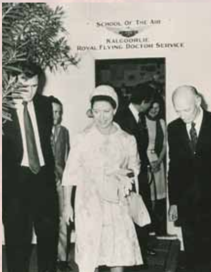
> HRH Princess Margaret visits the Kalgoorlie RFDS base in 1972