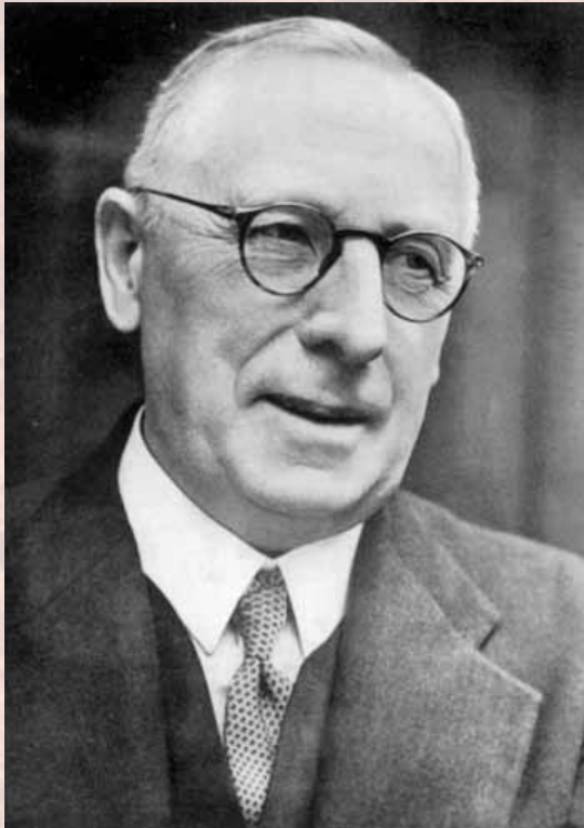
> Rev John Flynn