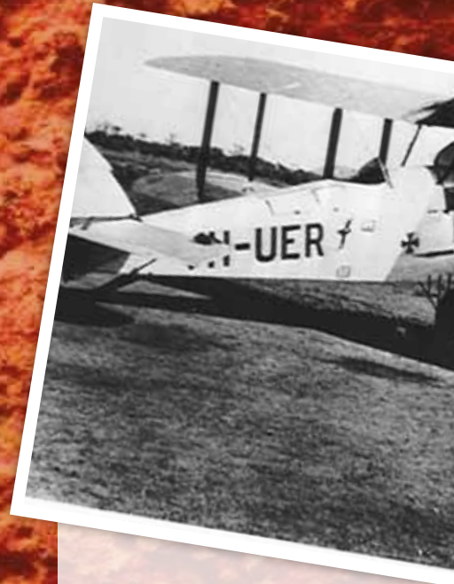
> The first aircraft

The Reverend John Flynn recognised a need for an aerial medical service after witnessing the daily struggles of Australian pioneers living in remote areas. After 10 years of hard work and campaigning, his vision became a reality with the opening of the Australian Inland Mission Aerial Medical Service (later renamed the Royal Flying Doctor Service) in Cloncurry, Queensland on 15 May 1928.