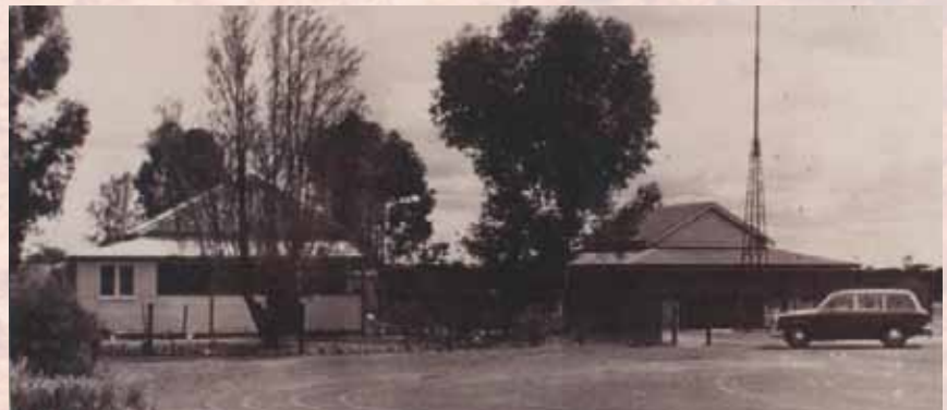
> Kalgoorlie radio officer's quarters