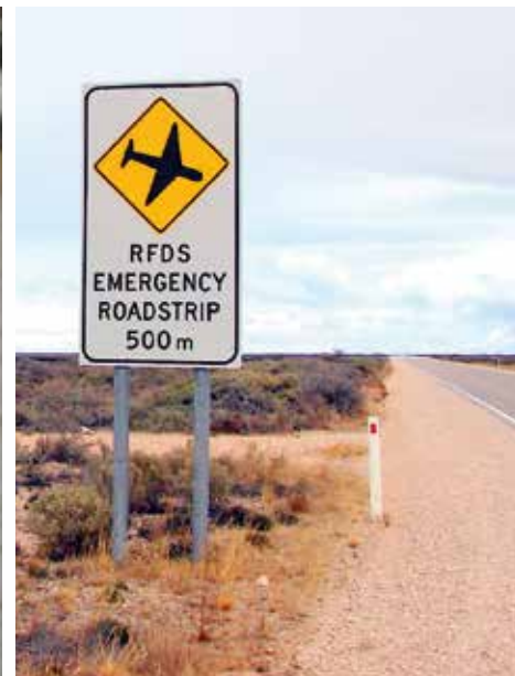
> Distinctive signs mark the location of RFDS airstrips on major highways.

"It was really magic. It was just great. Judith probably wouldn't be around otherwise. It's as simple as that.