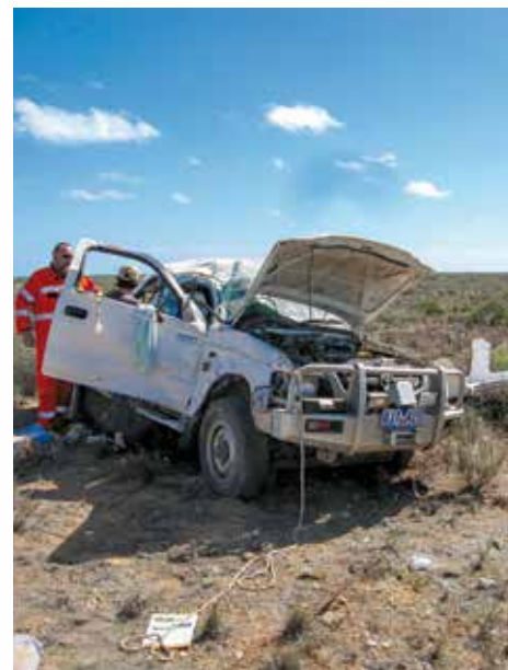
> The crumpled four-wheel-drive ute sits in scrub after rolling off the Eyre Highway.

As the rest of Australia celebrated New Year's Day, a RFDS Pilot and Flight Nurse