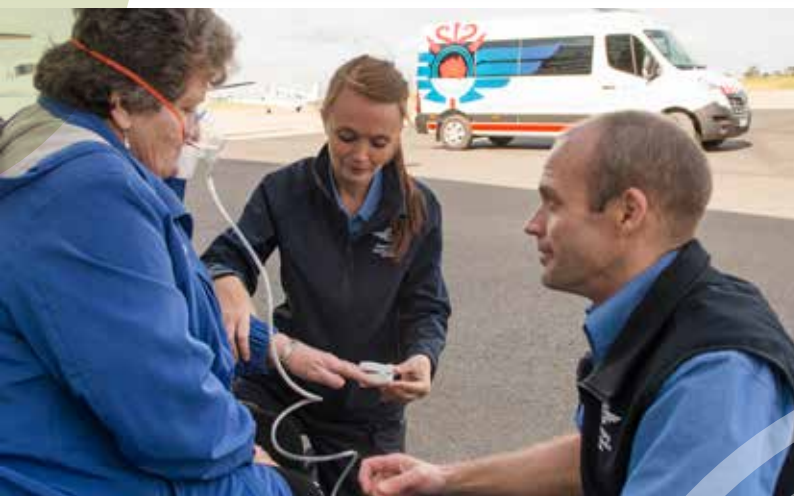
RFDS staff with patient.