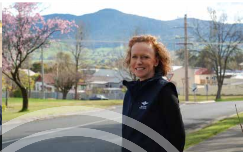
Rural Women's GP in Corryong, Victoria.

A Gift in your Will translates to making this all possible. The vital funds generated through these Gifts mean up-to-date equipment and facilities. We can continue to provide medical attention and healthcare to all Australians.