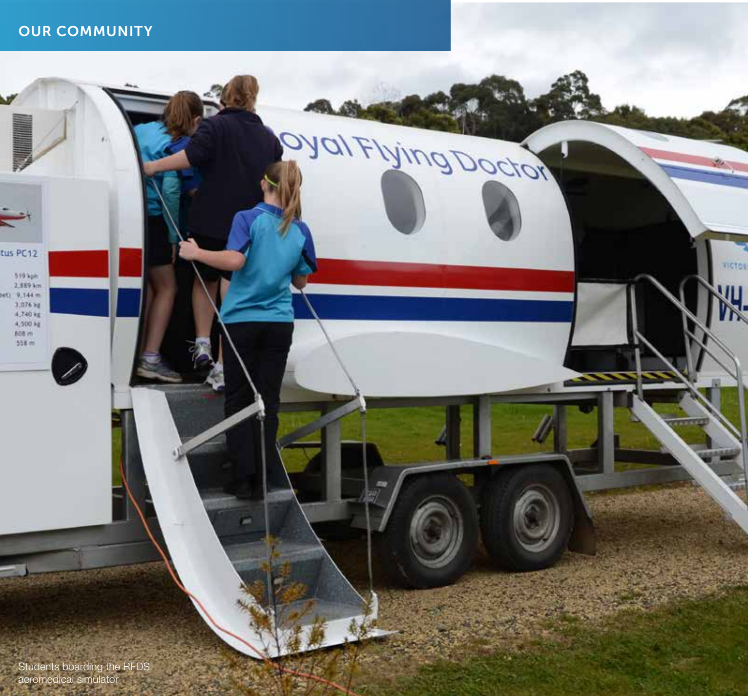
Students boarding the RFDS aeromedical simulator

Medical research is best applied into the population in which it was conducted. As most medical research institutes are in large metropolitan areas they conveniently sample the readily available population neglecting rural areas and their special needs. The large-scale clinical trials I have been involved with have sought to address this by setting up research hubs in regional cities that can serve the regional towns and the country people around them. This has been mutually beneficial as country people have volunteered for our studies in greater numbers compared to their city cousins. It also provides local employment as those who work in these areas live locally.