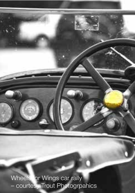
Wheels for Wings car rally

The large-scale clinical trials I have been involved with have sought to address this by setting up research hubs in regional cities that can serve the regional towns and the country people around them.