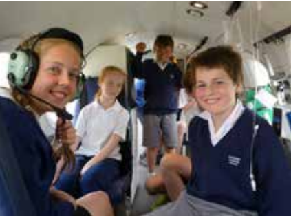
Students from Devonport Christian School enjoying the aeromedical simulator