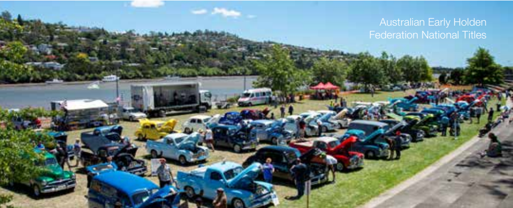
Australian Early Holden Federation National Titles

The 22nd Australian Early Holden Federation (AEHF), FX and FJ national titles were held in Tasmania in December and the RFDS was nominated as one of their charities of choice during the titles.