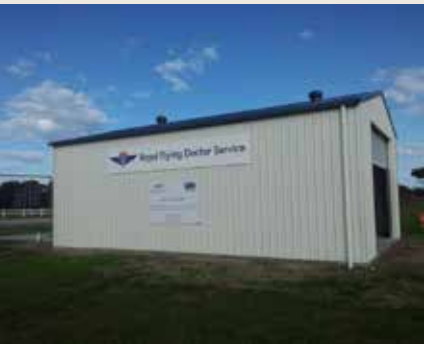
Flinders Island patient transfer facility

RFDS Tasmania developed the design of patient transfer facilities for regional airports around Tasmania. The purpose built facilities are used to improve the overall comfort and safety of Ambulance Tasmania patients and assist medical staff during the transfer of patients from road ambulance to air ambulance.