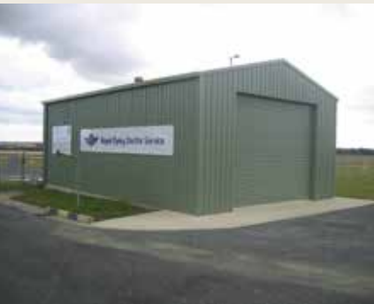
King Island patient transfer facility